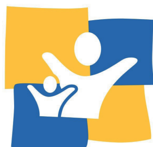
Parents Association European School Mol